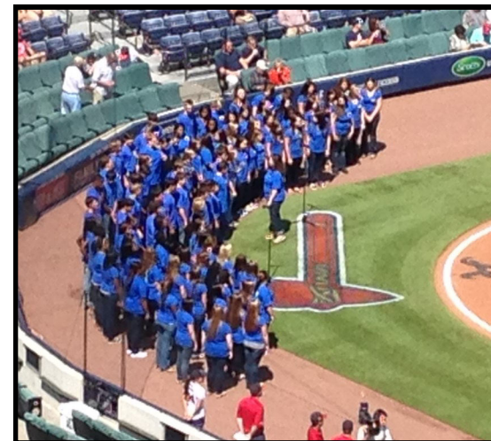
TCHS Choir members sing the National Anthem at an Atlanta Braves Game

"Choir has been a life-changing experience for me. I entered the program my junior year, and my only regret is that I didn't join sooner. I have made numerous friends that I would have never made outside of choir, and I have developed my voice far beyond what I could have imagined. Because of choir, I have become more sociable and confident, and I would not change this amazing adventure for anything."