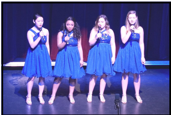
Sophomore girls perform "Stay With Me" at the Bama Theatre