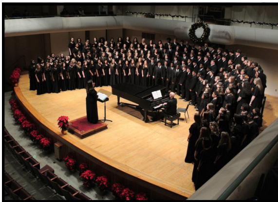
Combined Choirs sing Handel's Hallelujah Chorus at the Christmas Concert

"Choir introduces you to new people and you'll make friends. It challenges you and you'll actually learn something. I look forward to going to choir; it's a lot more fun than a regular class. As a freshman, choir will give you a niche to fit into."