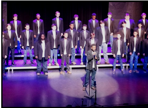
Men's Choir sings "When I Was Your Man" at the Showcase Concert

No. The only required fee is the uniform rental fee, which is generally less than $100 per year. We do several fundraisers each year to give each student the opportunity to pay this fee. Choir is a great deal compared to many of the other activities at TCHS that cost much, much more and don't last all year.